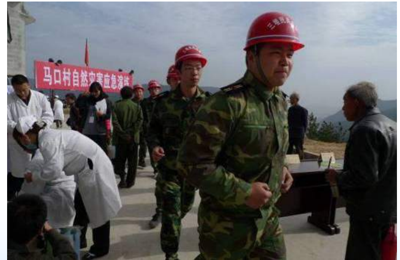
Emergency response drills at Makou villages Sichuan Province, November 2009