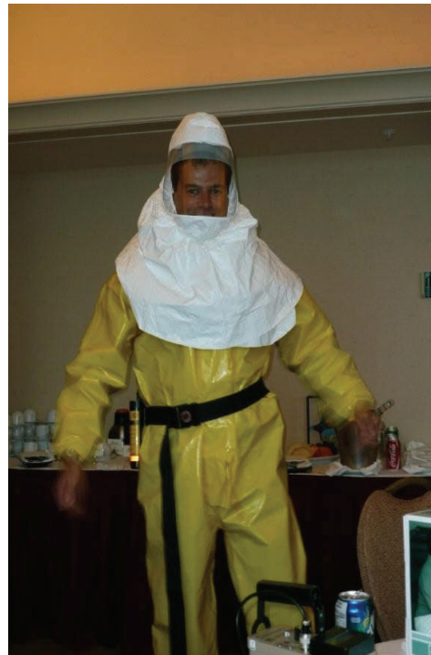
Demonstration of Personal Protective Equipment

of the Health Sector through a dedicated Hazardous Substance Response Program, requiring the support of relevant health sector partners.